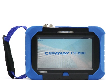
Main unit CT-200